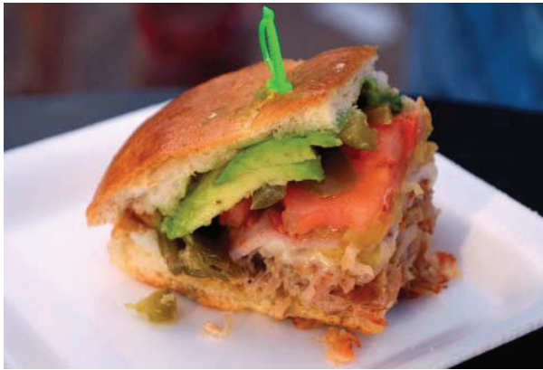
This torta from Los Reyes de la Torta may look like it's hiding a pea from a princess, but its real secret is a complex collection of fresh flavors.

Served in a tiny plastic cup that, with a little color, would make a perfect red solo cup for your kids' Barbies , this tequila woke up our palette with a very strong flavor. Which is good, because the chimichanga sample we had next - from the new Caldero Mezcal & Tequila Bar in Scottsdale - was filled with white meat chicken but undeniably bland. It was paired with chips and queso; the queso had a pleasantly spicy aftertaste , but the whole plate had cooled off by the time we started eating.