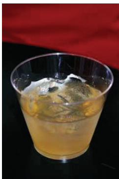
This Spiced Cider Margarita, served by Cruz Tequila, was a refreshingly cool afternoon treat.

Outside, the lines were worse (sorry, Citizen Public House , but even the promise of an award-winning margarita wasn't enough to get us to stand practically on top of the Hidalgo Cigar booth to someday reach your table ). Phoenix's Los Reyes de la Torta restaurant served one of its signature tortas , a mini-sandwich piled high with fresh jalapenos and avocado, with at least five different flavors in every bite. We cleaned our plates in the line for America's Taco Shop , serving up their own local favorite: the Carne Asada taco . Savory and sweet - and above all, fresh - this taco was another moment of rest amidst the chaos.