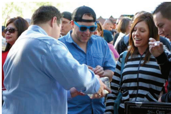
Tequila-tasters who reached the front of the Cruz Tequila line could take their time sampling the brand's silver and reposado varieties, as well as a sweet and cool margarita.

Since its launch in 2009 , the Phoenix Tequila Fest has grown into a big annual event - maybe a little too big. This past weekend, crowds descended on US Airways Center - that is, just outside the doors and inside the entryway - to taste smooth tequilas, margaritas, and samples from local Mexican restaurants.