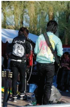
LA sensation Monte Negro took the stage, on rock-band time, late Saturday afternoon.

Follow Chow Bella on Facebook and Twitter .