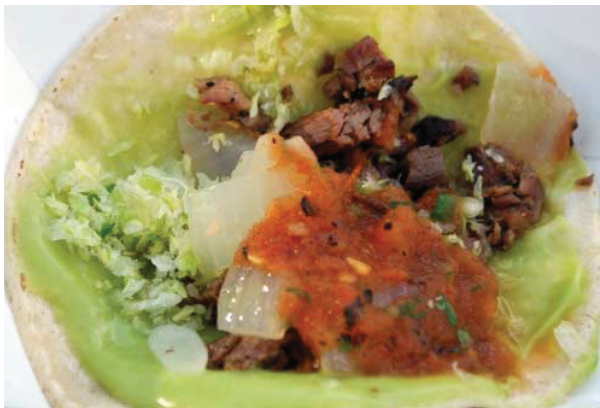
Local favorite lunch spot America's Taco Shop served its signature Carne Asada taco.

Served in a tiny plastic cup that, with a little color, would make a perfect red solo cup for your kids' Barbies , this tequila woke up our palette with a very strong flavor. Which is good, because the chimichanga sample we had next - from the new Caldero Mezcal & Tequila Bar in Scottsdale - was filled with white meat chicken but undeniably bland. It was paired with chips and queso; the queso had a pleasantly spicy aftertaste , but the whole plate had cooled off by the time we started eating.