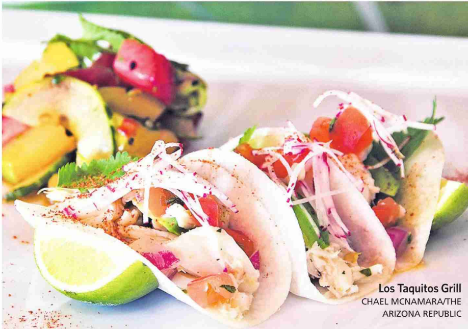
Los Taquitos Grill

Details: 5101 N. Scottsdale Road, Scottsdale. 480-543-1043.