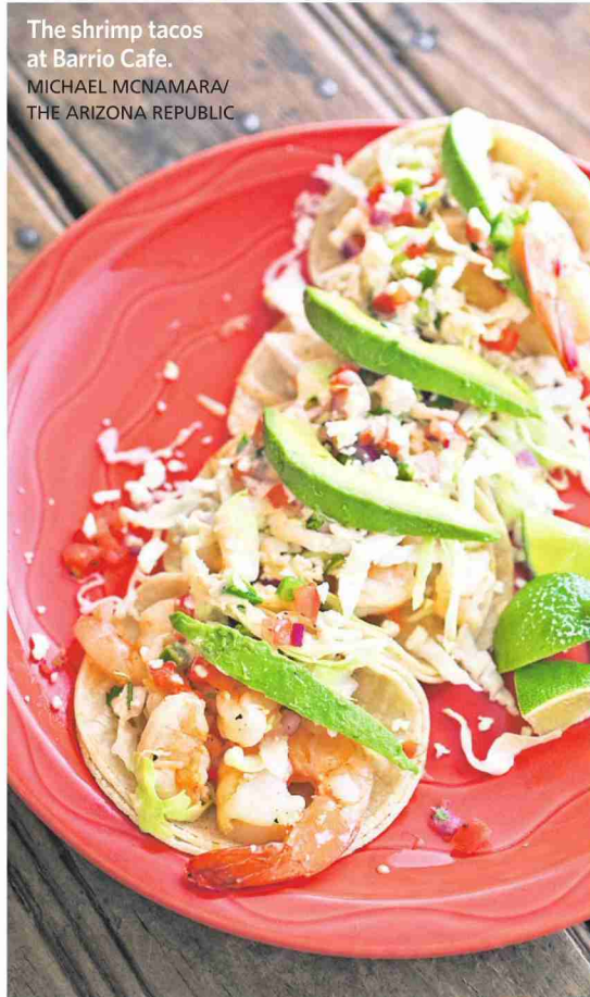
The shrimp tacos at Barrio Cafe.